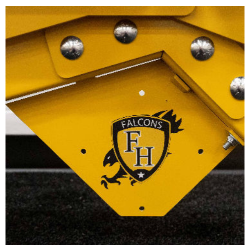
Bolt On Logo Plate