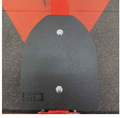
12" x 15"