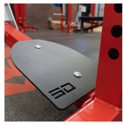
Bolt On Spotter Plate