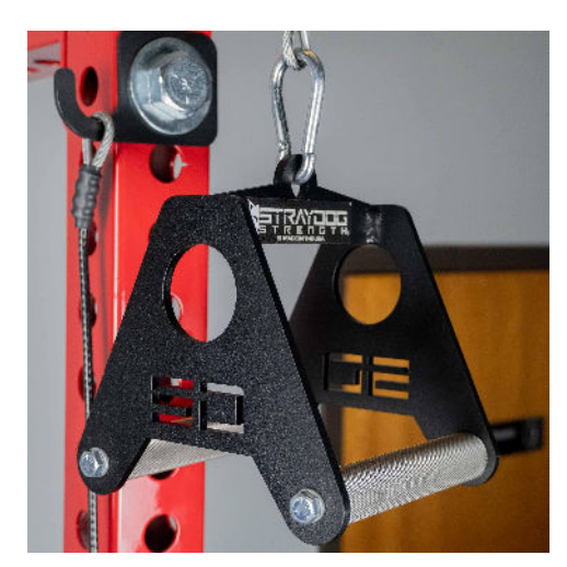
Add to Cable Machine