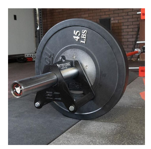
Add to Bar for Landmine Movements