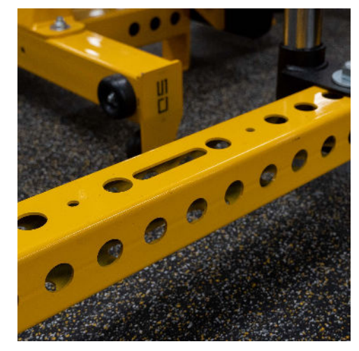
Machine Add on Hole pattern