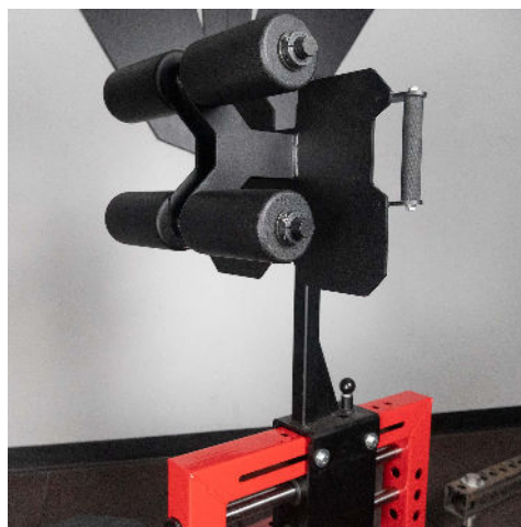
Dual Roller Footplate