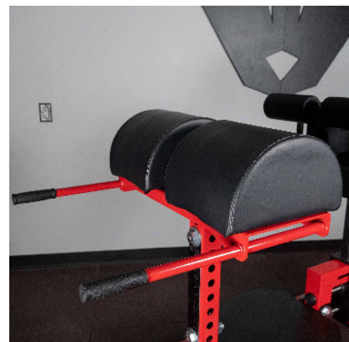
Custom Upholstery Options