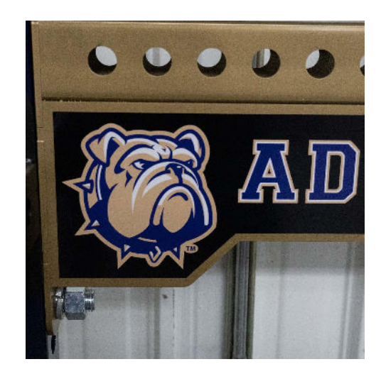
Use mulitple colors