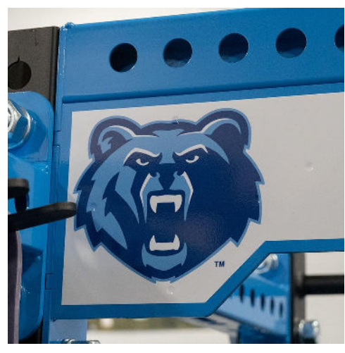
Decal Can be very detailed