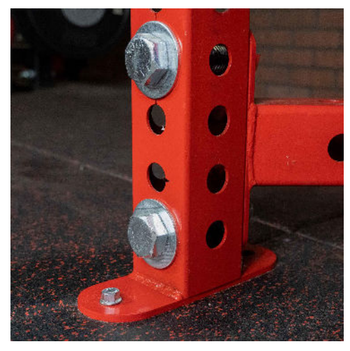
Built in Bolt Down Tabs