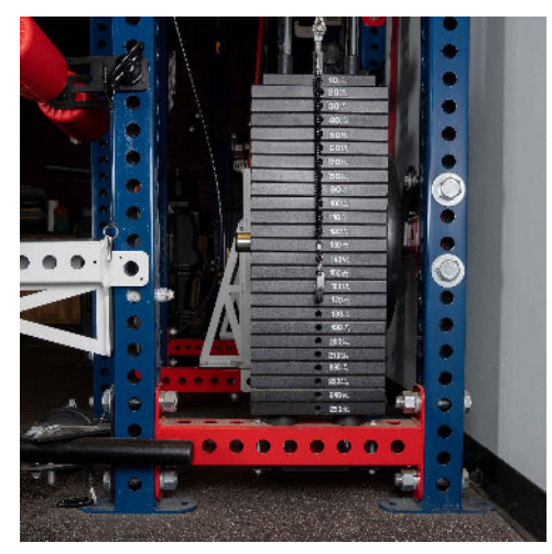
200, 250 or 300 LBS Stacks