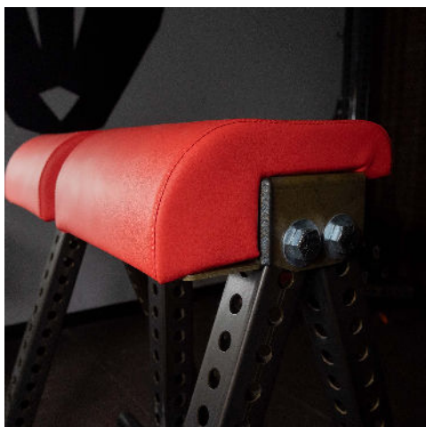
Only Black Pad Option