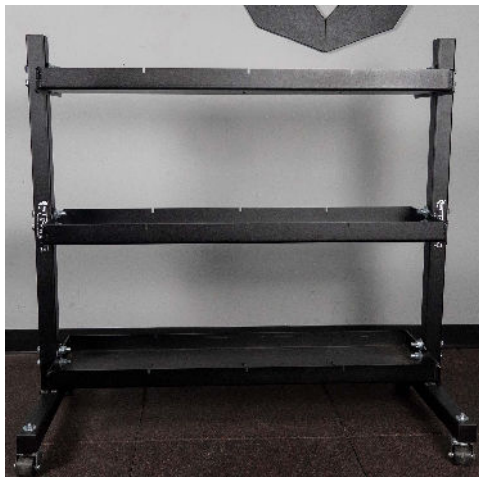
3 43" Flat Trays