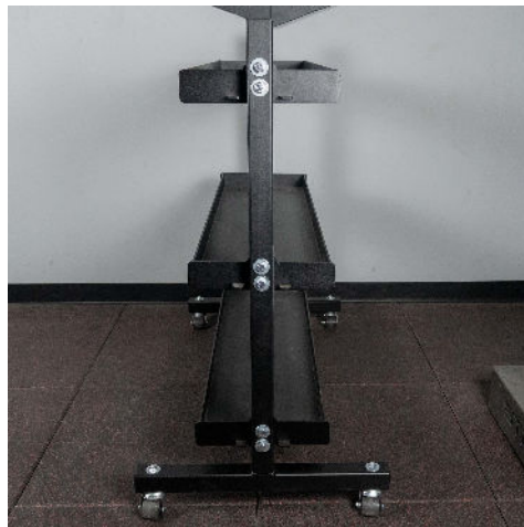
12" Deep Trays