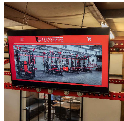
TV Mount Option