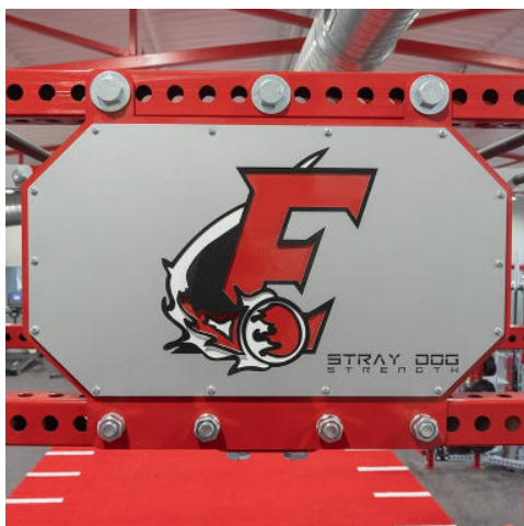
Laser Cut Logo Option