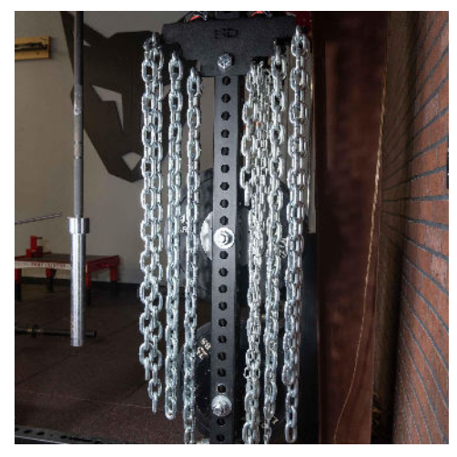
Holds Chains off uprights