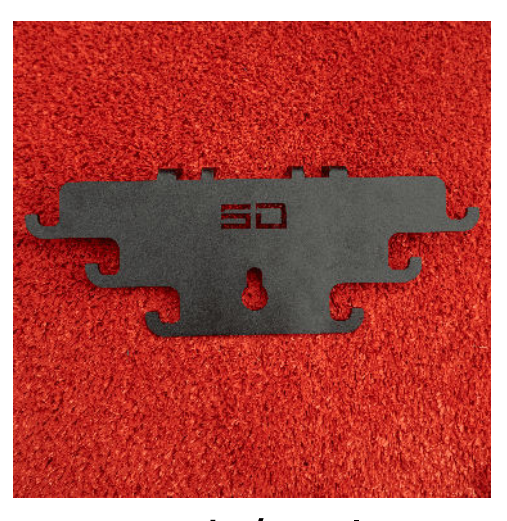
1" and 5/8" Hole