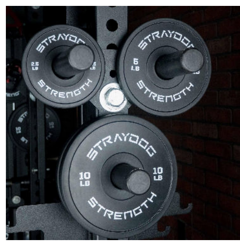
Holds 2.5,5 and 10 LBS plates