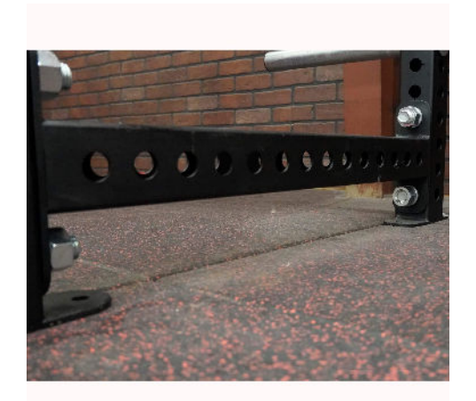
3.75" underneath for feet