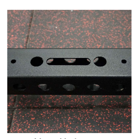
Guide rod hole pattern