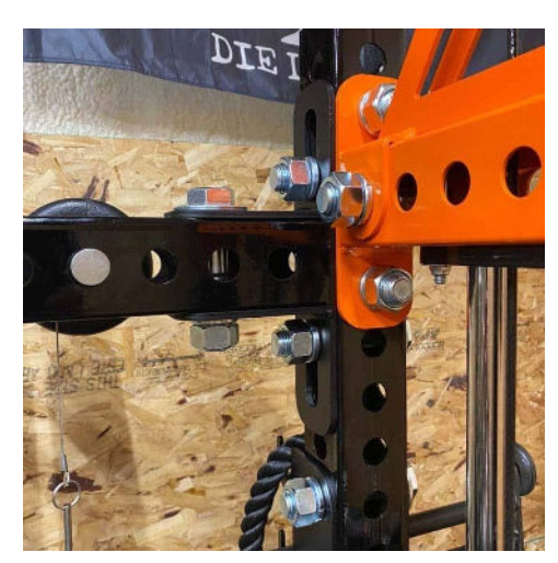
Universal Bracket Connected to Stray Dog Upright