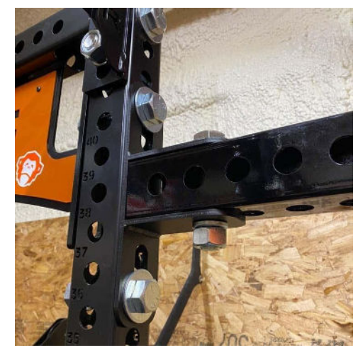
Universal Bracket Connected to Rouge Monster Upright