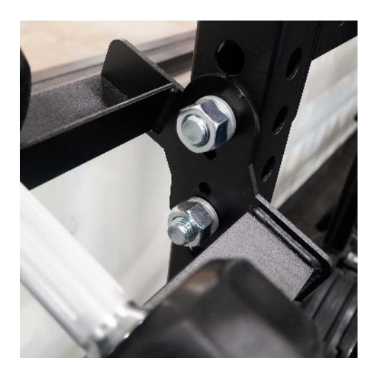
Sticks 4" out back