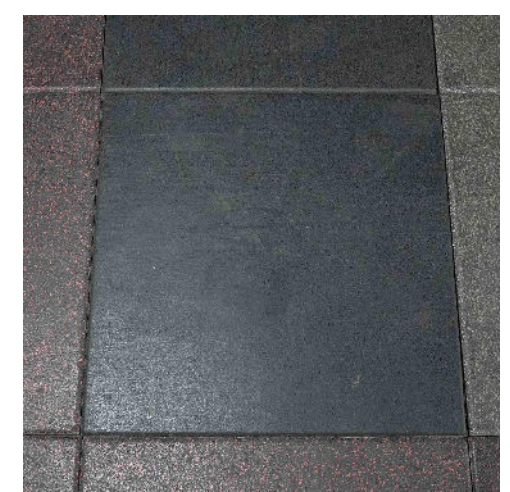
24" x 24"