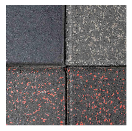
Connect without glue