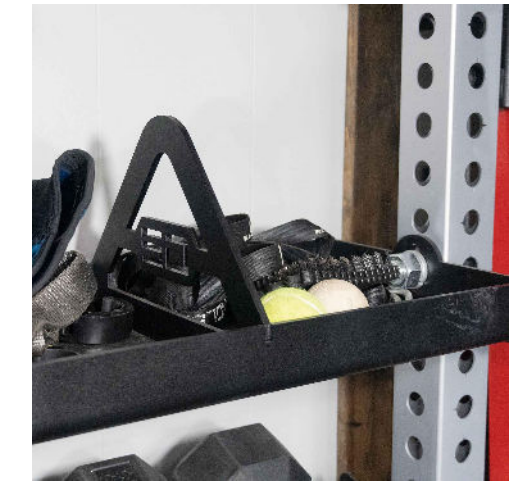
Add Divider to separate items