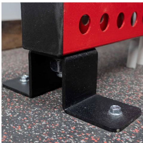
9.5" Wide Bracket

The Floor/Wall Mount Bracket was designed for 3x3 tubes allowing customers to mount a 3x3 tube to the floor or a wall. They are sold individually and come with one 1" bolt assembly, they have two 1/2" mounting holes 7.5" on center to mount to the Floor/Wall.