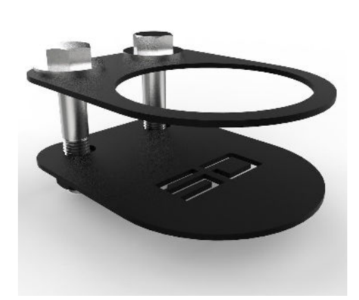
Single Foam Roller Storage