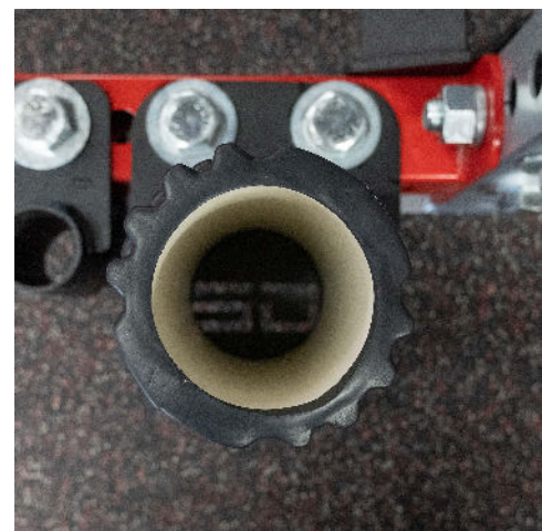
Holds single foam roller