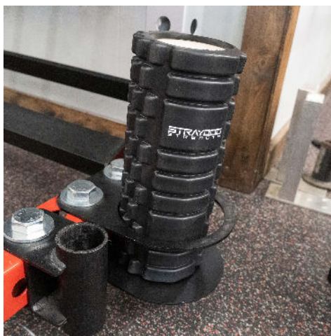
Attaches with two 1" bolts 1 hole between bolts