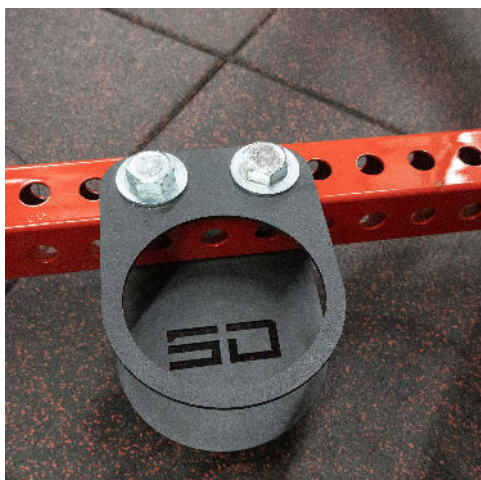
SD logo cut out