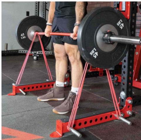
Attach to Rack or ATR

The Front Feet Attachment are the same thing as the Half Rack Band Attachment except they do not come with 4 band pegs which the Half Rack band attachment does. Band Pegs can be added to the front feet for band resisted lifts. The Front Feet are used to add stability to the rack and are recommended if the rack is not bolted down.