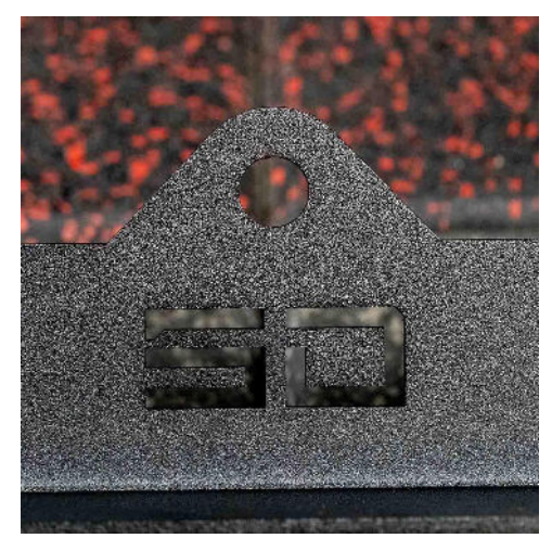
Laser Cut Logo and Carabiner hole