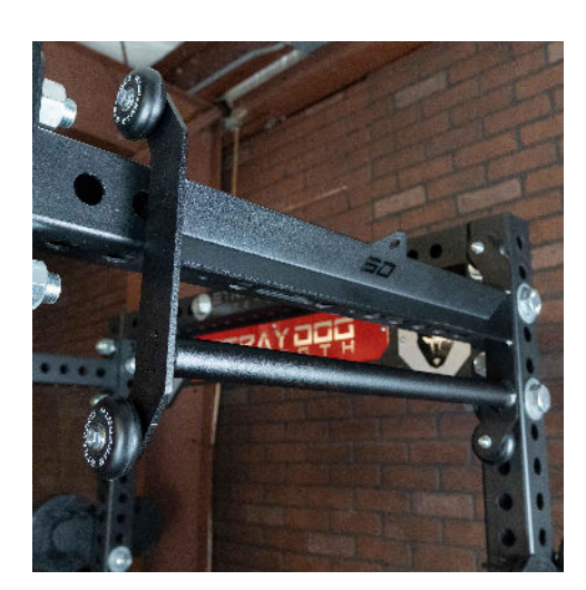
Built in storage tabs for 1" Crossmembers