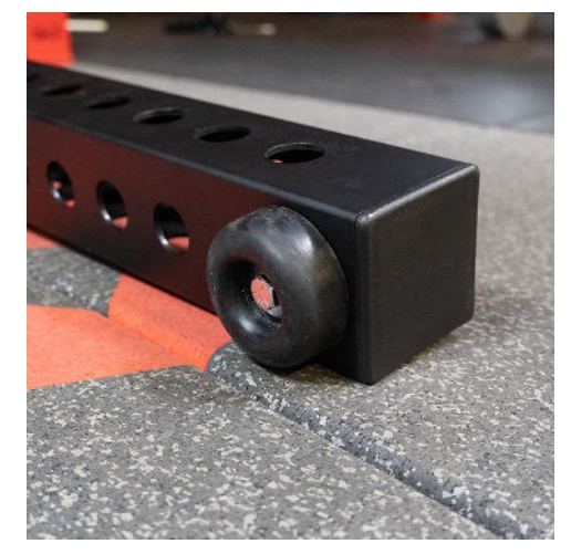
Bumper to protect upright