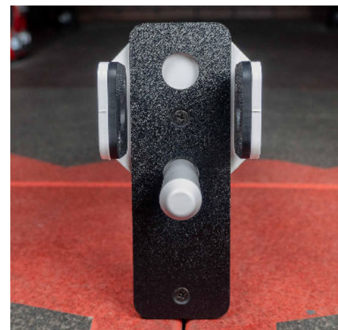
Plastic to protect post