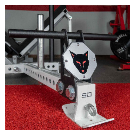
Eye Bolt for straps or bands