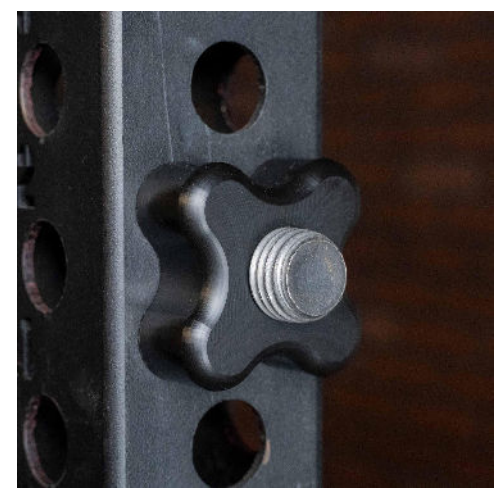
Adjustable Nut with Plastic