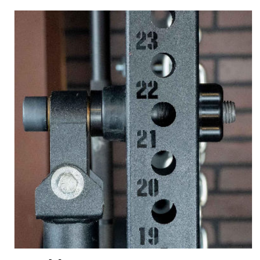
Rubber Stop to protect post