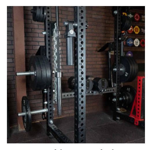
Movable to any hole