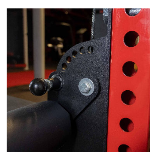
Adjustable Knee hold