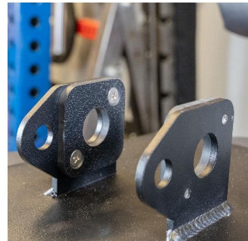
Plastic to protect post/spotter arm