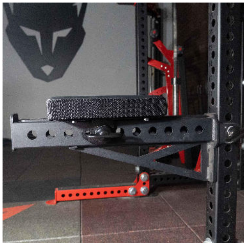
Attach to spotter arm for seat