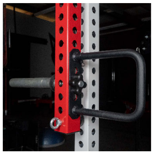
Independent Handle and Weight Peg