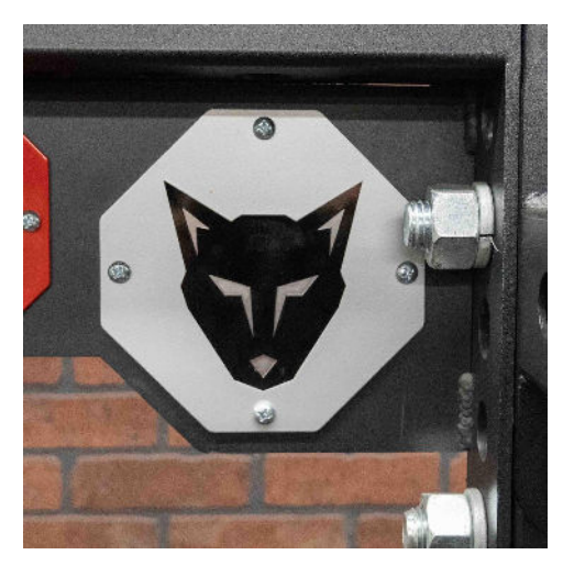
Hexagon laser cut out is 6.5" x 6.5"