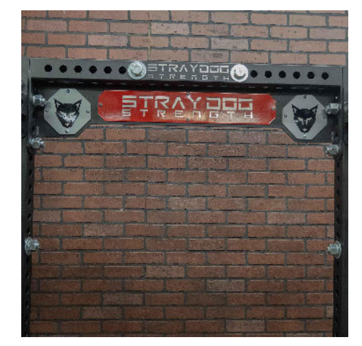
Always comes with small SD Logo Plate