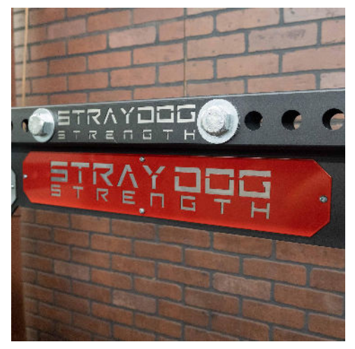
Custom Name Plate