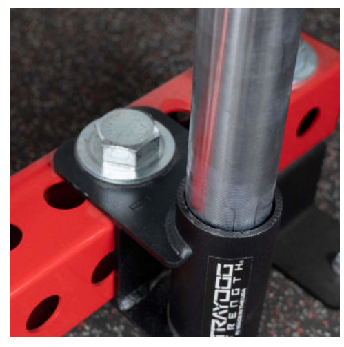
Bolt onto any 1" hole