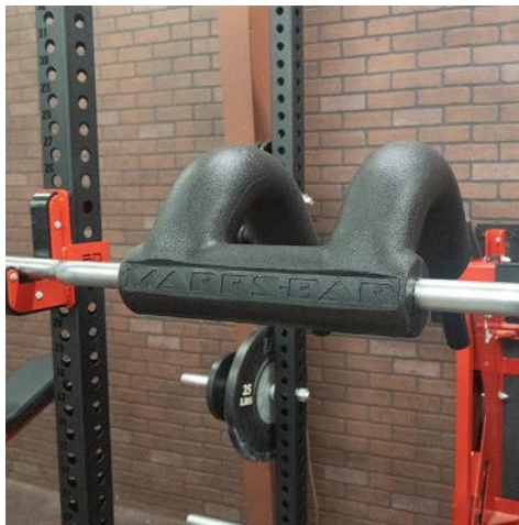
4.5" Thick Foam Pad