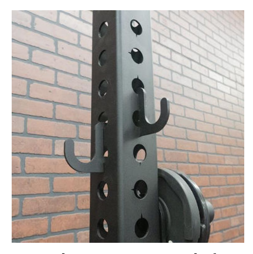
Attaches to any two 1" holes