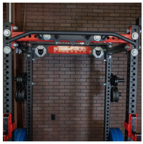
Black Texture Paint for grip