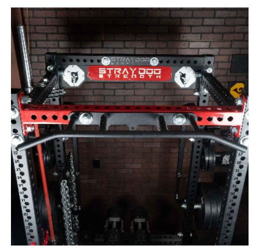
Neutral Grip and angled grip