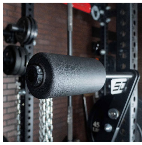
Injection molded Pad