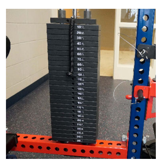
1:1 Ratio weight Stack