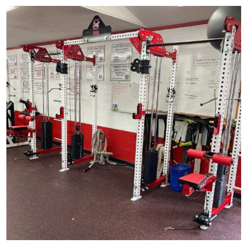
2 Lifting Stations no Trays