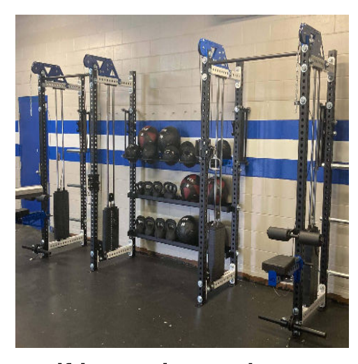
2 Lifting Stations and 3 Trays