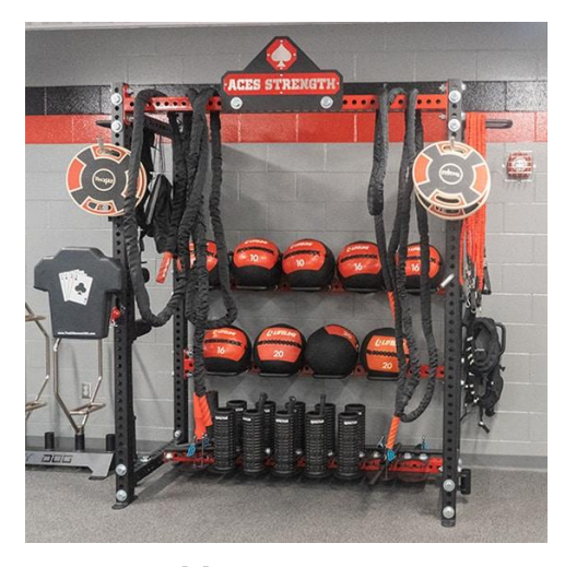
Add Logo Topper