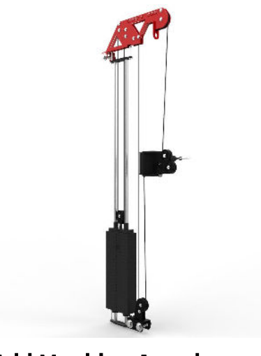
Add Machine Attachments