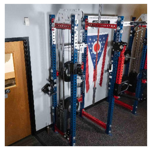
ATR Cable Column