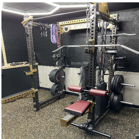
88" Cut Down