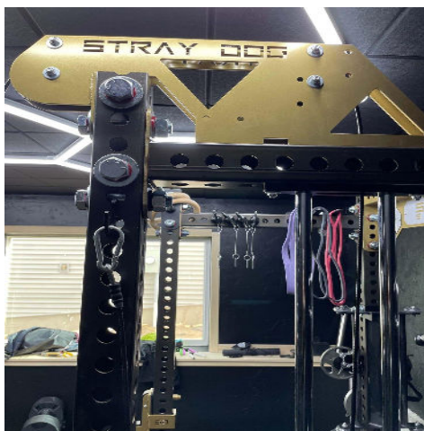
We aim to be 2-4" below the ceiling height