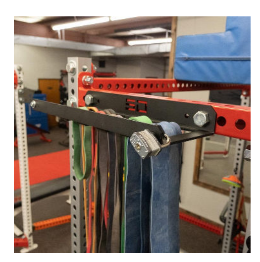
Add a Lock