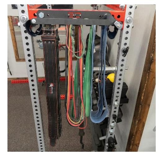
Store bands, belts ,straps knee sleeves and more