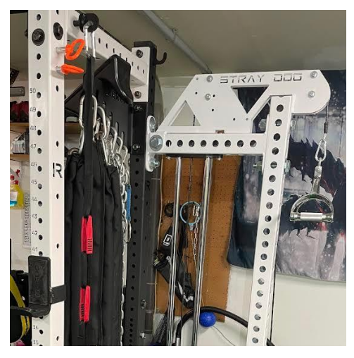
Bolt onto any 1" hole or connect to wall