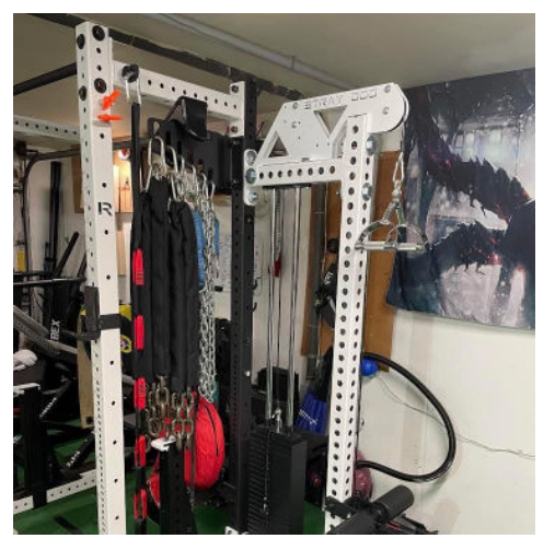
Attached to 5/8" rack