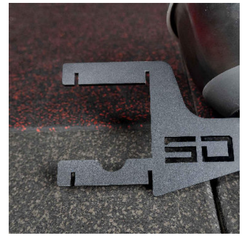
Gravity Slit attachment