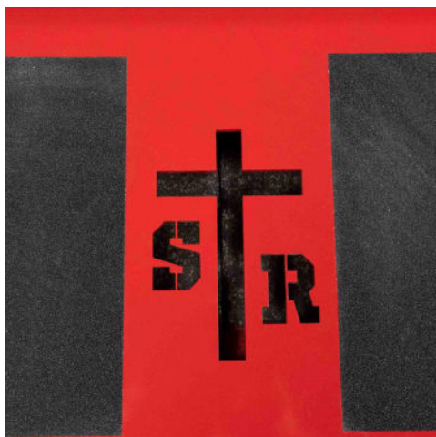
Laser Cut Logo