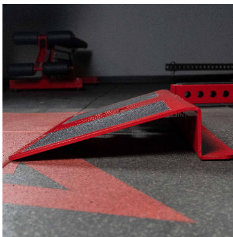
15 Degree Angle