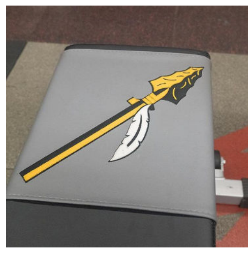
Choose Upholstery Color