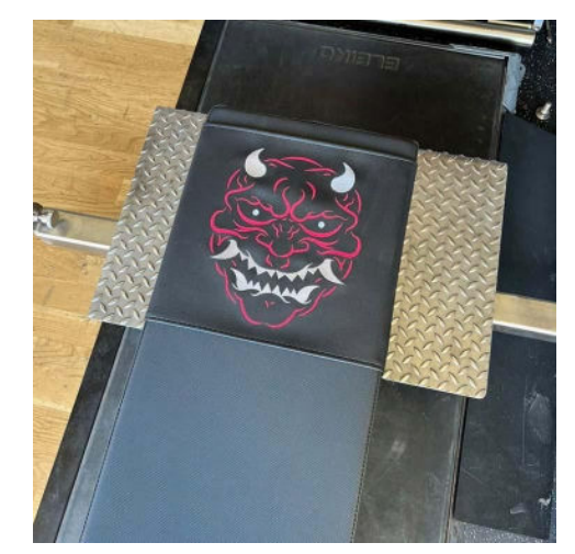
Custom Stitched Design