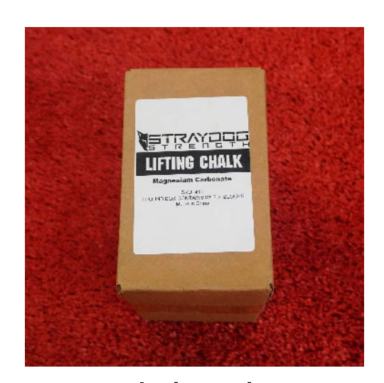
8 Blocks per box