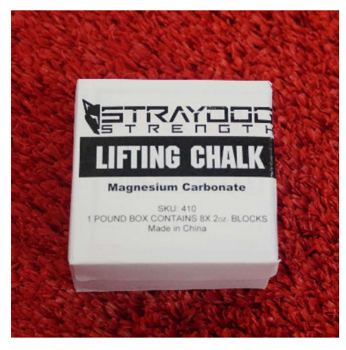
2 OZ Blocks