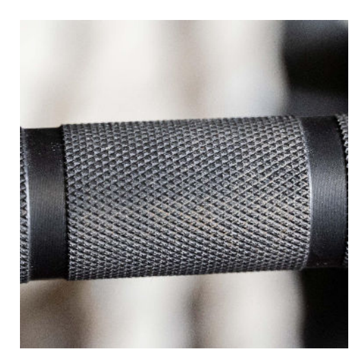
Olympic and Powerlifting Marks