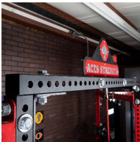
3x3 11 Gauge Steel Tube