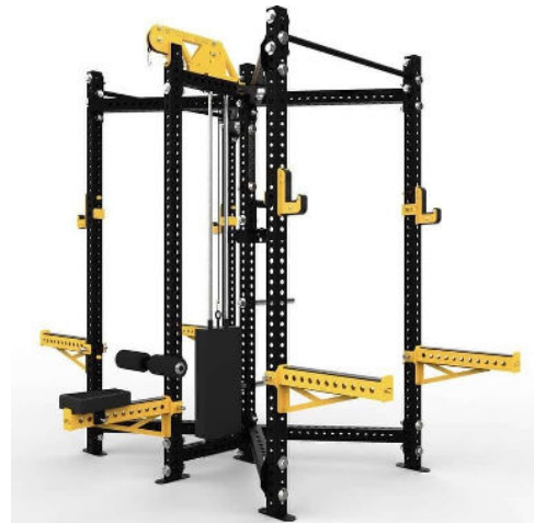
Attach a cable column, Lat Pull down or Belt squat