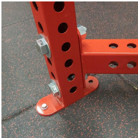
Bolt Down Tabs

The Triad rack is Patent Pending for its 3-post Triangular construction which is more efficient as it uses less parts and takes up a smaller footprint. Triad Racks can have Rack Mounted Machines added to them off the side of the back middle post which does not increase the footprint of the unit or you can add them off the back which adds 23" to the footprint.